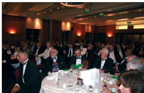
President's Dinner 2010