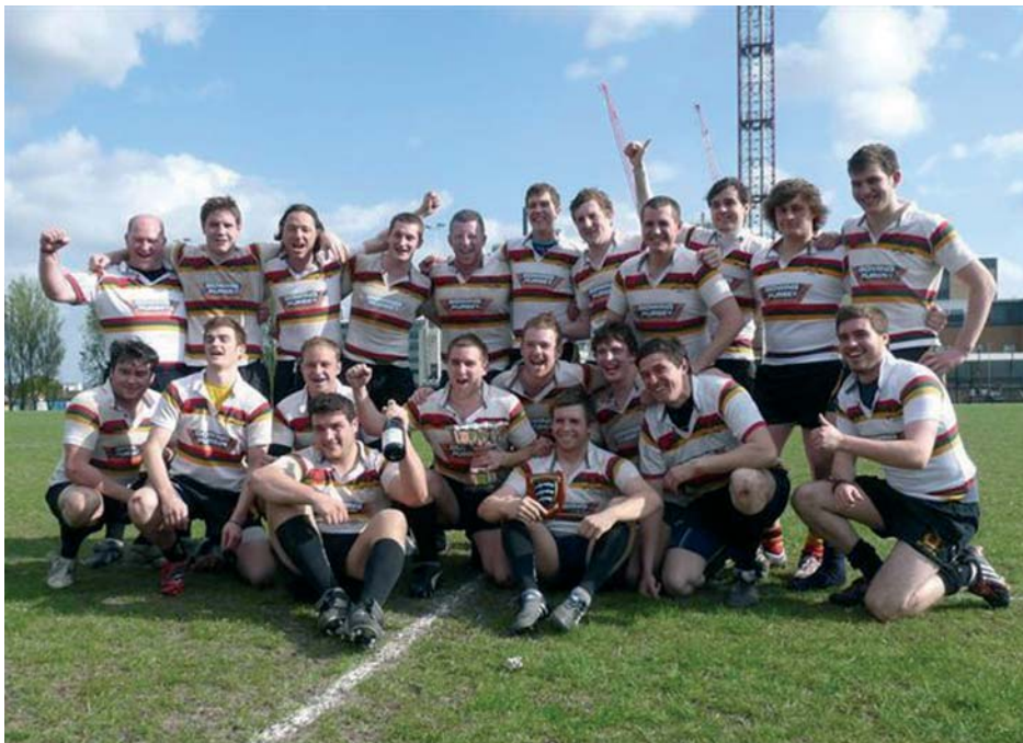
Winning Team with the Bowl Trophy