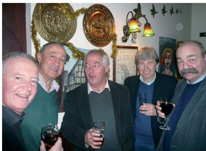
...and still standing