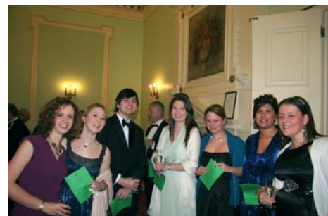
The Younger Generations