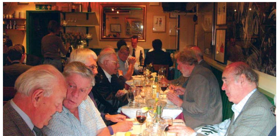
Fifty Years on and now sitting!