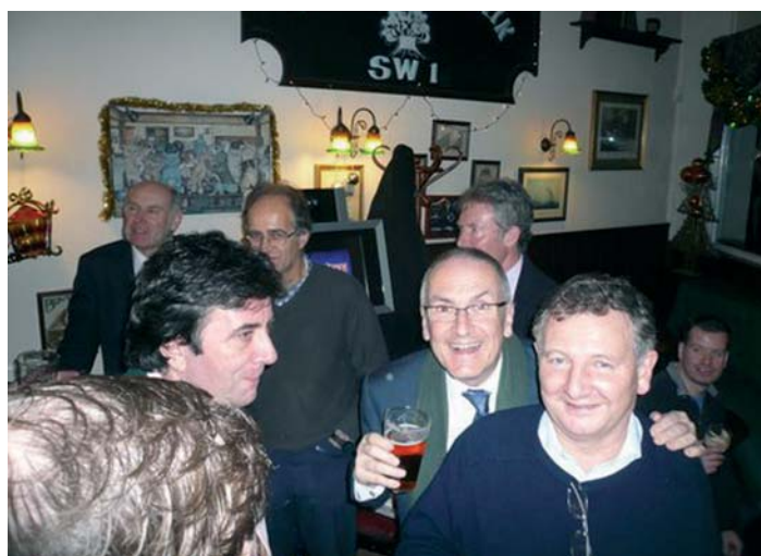
Forty Years on...